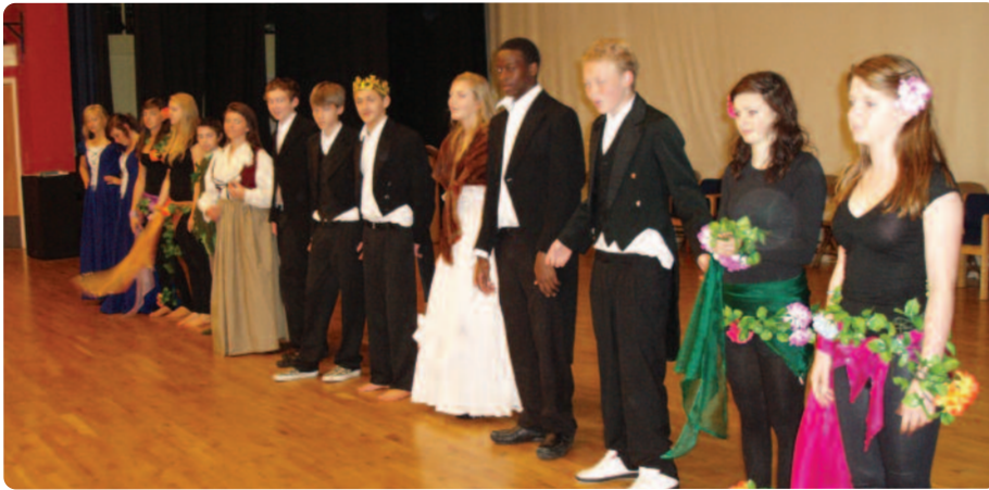
The cast at the end of a dress rehearsal