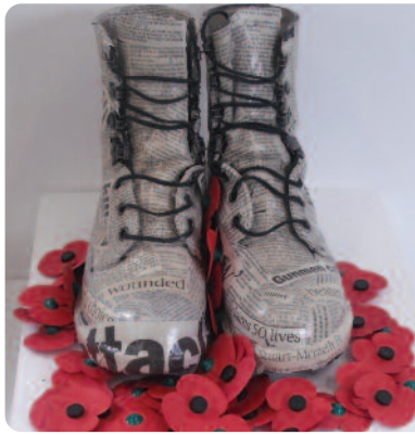
▲ by Jack Galliano (mixed media construction)