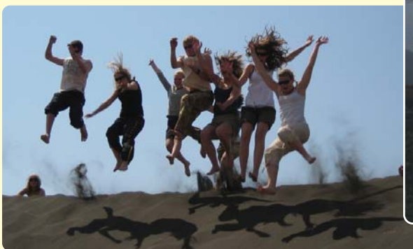
Having fun at 'The Shifting Sands'