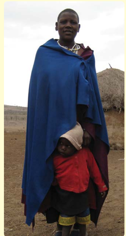
Masai mother and child

Over the coming year we are aiming to build a dining area, kitchen and playground at Lerang’wa School, all things they desperately need. So please keep fundraising. You are helping to make a huge difference to many people’s lives.