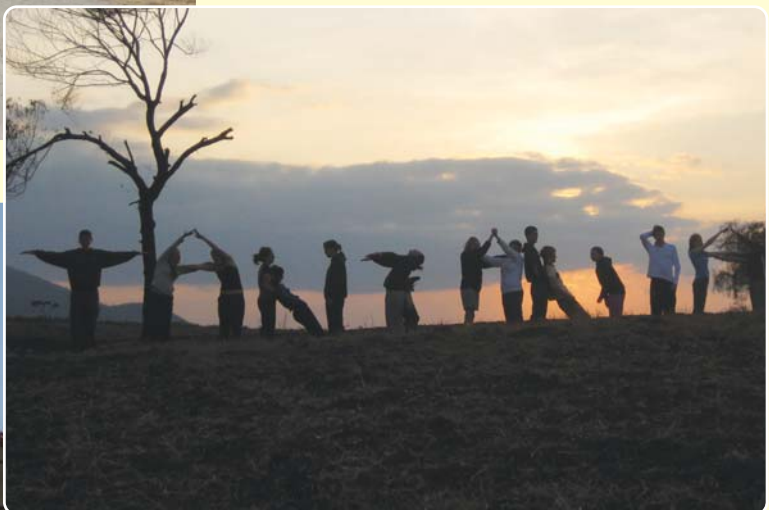
Spelling test at sunset