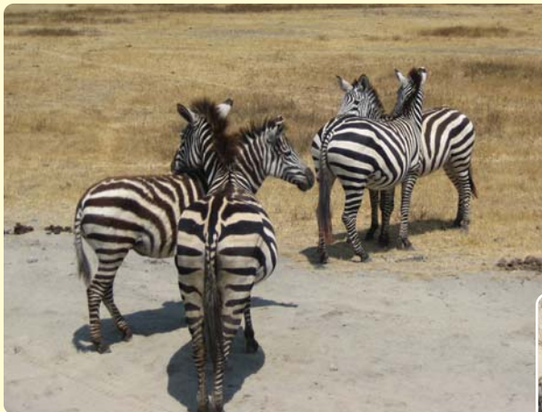
Zebra relaxing in the Ngorongoro crater