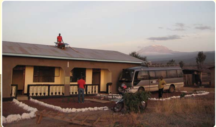
Solar power being installed on the new teacher accommodation, all thanks to YOUR donations