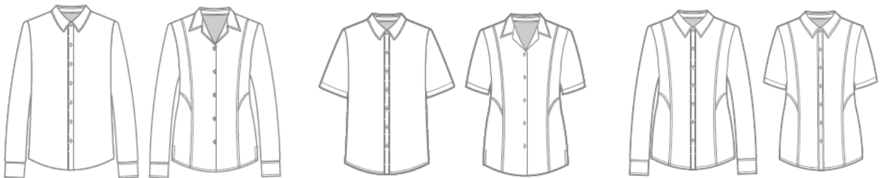
White revere collar blouse, white shirt and button to neck blouses