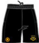
Shorts (multi-purpose and unisex fit)