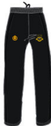
Tracksuit bottoms (unisex fit)