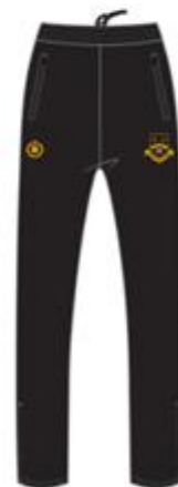
Micro Fleece Trackpant (unisex fit)