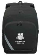
Litepak Bag Small