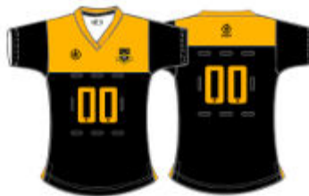
Fitted Games Shirt (netball and more)