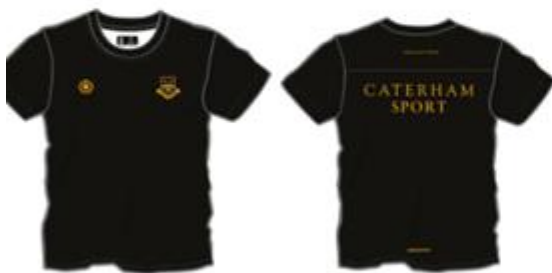
Sixth Form Performance Tee