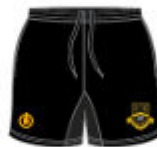
Shorts (netball and more)