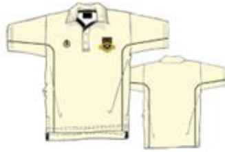
Cricket Polo Shirt