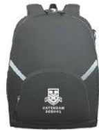
Unopak Bag Large