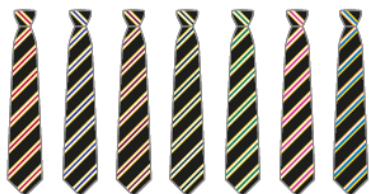
Aldarcombe Harastone Lewisham Ridgfield Underwood Nawington Townsend