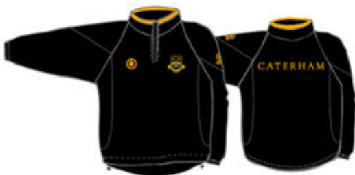
Polar Fleece (unisex fit)