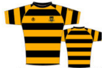
Reversible Games Shirt (rugby and more)