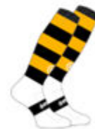
Black and yellow playing socks (rugby/hockey socks)