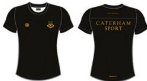
Sixth Form Performance Tee