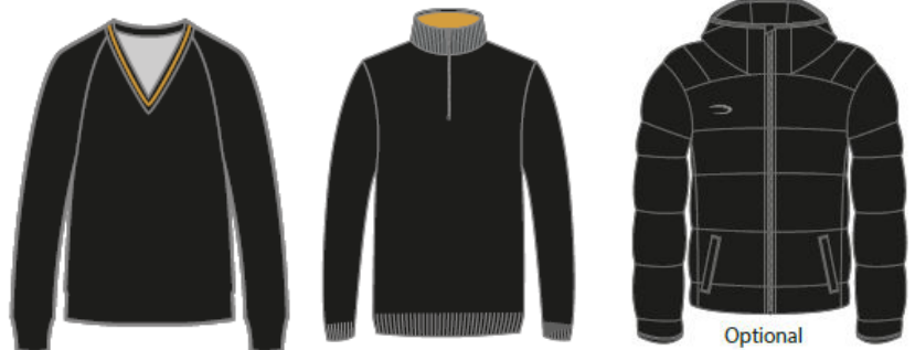
Black V-neck jumper with trim or quarter zip jumper