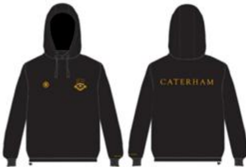
Sixth Form Hoodie – Unisex fit